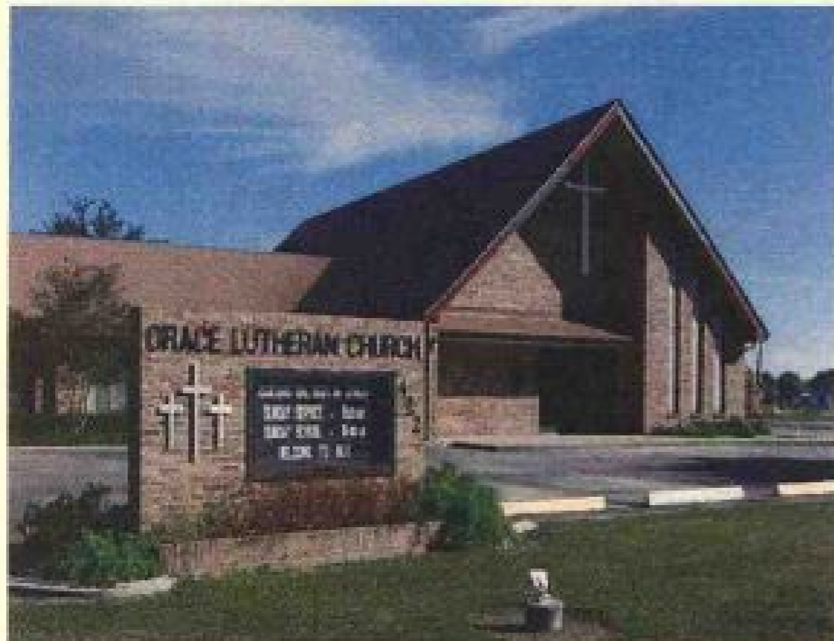
A brief history of Grace Lutheran Church 1956 to 2007